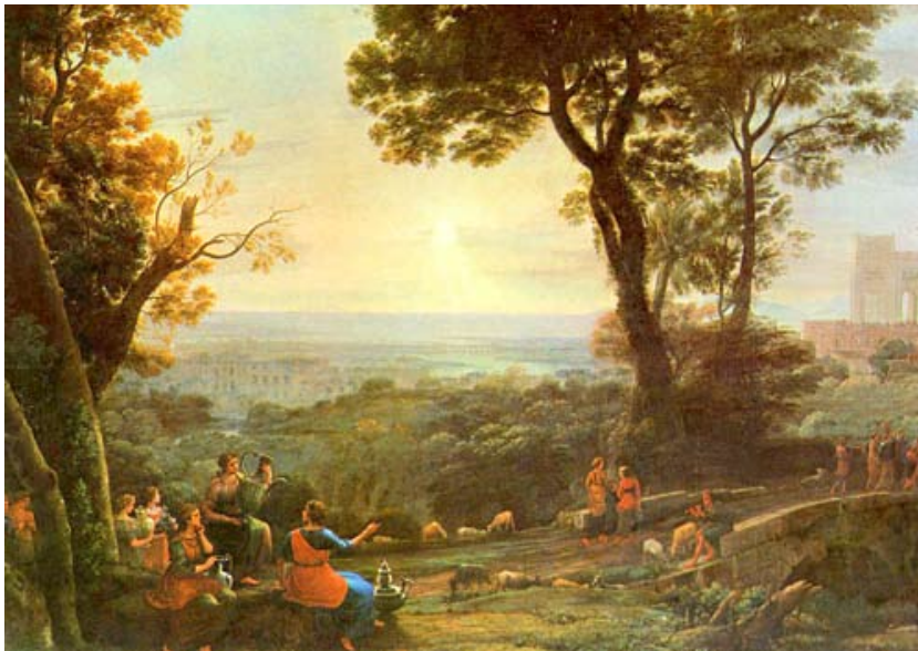
Claude Lorrain, Delphi with an Offering Procession , seventeenth century.

Future priestesses of Apollo did not pass through special training or practice, with the exception of the necessary basic preparation led by Kleio. Rituals and other procedures, were learned in the doing. Actually, some